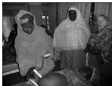
- Maternal Healthcare Project -