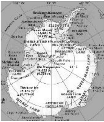
Antartica - Larsen's Shelf

drought, intensify storms and alter climates around the world. Over 20,000 people dying last year in Europe due to a persistent heat wave, was a global warming relevant event. Nothing good comes to us from more carbon emissions. Sadly, it is our children and grandchildren who will bear the brunt of this miscalculation on our part.