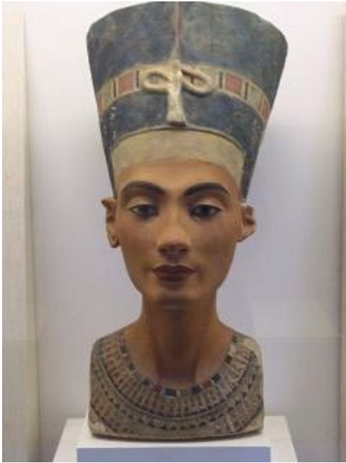
Nefertiti – Egypt's Sun Goddess

Everyone knows that gender equality and girl education are two most important standards for reducing poverty. Few, however, know that Egypt has been a leader in this area since the days of the pharaohs. In the ancient world, Egypt was virtually unique in its sharing of power between men and women. That Egyptian women had relative freedom and exercised power and self-determination was unusual and shocking to neighboring countries. Greek historian Herodotus noted in 450 BC that the Egyptians "have reversed the ordinary practices of mankind." He described how women "attended the market and took part in trading, while men sat at home and did the weaving." Women had financial independence and received equal pay as men for undertaking the same job. This enlightened attitude toward sexual equality was in many ways a logical ex-